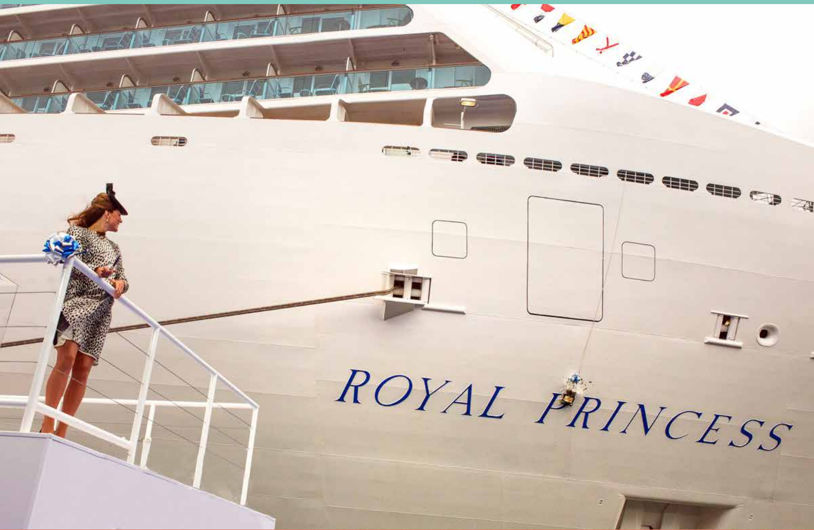
The Royal Princess Cruise Launch